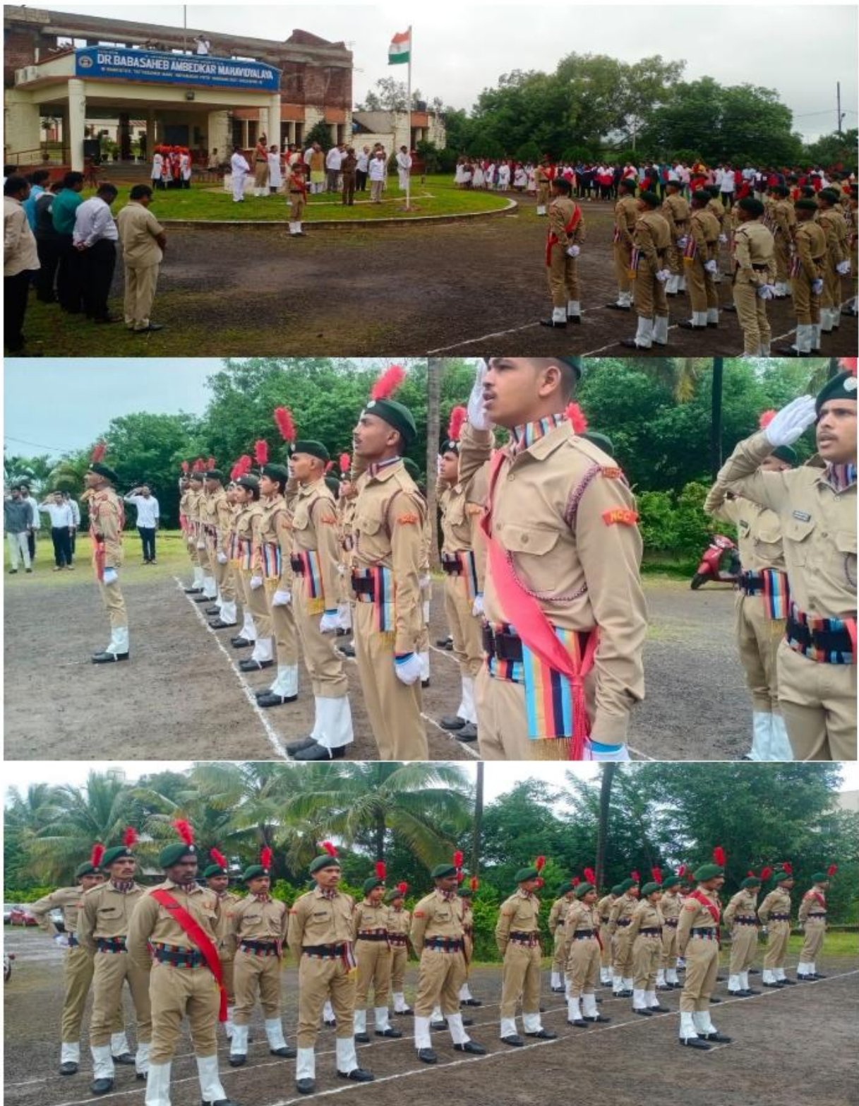
Dr. Babasaheb Ambedkar College Students, Teachers, Non- Teaching Staff, NCC Cadets Celebrating Independence Day