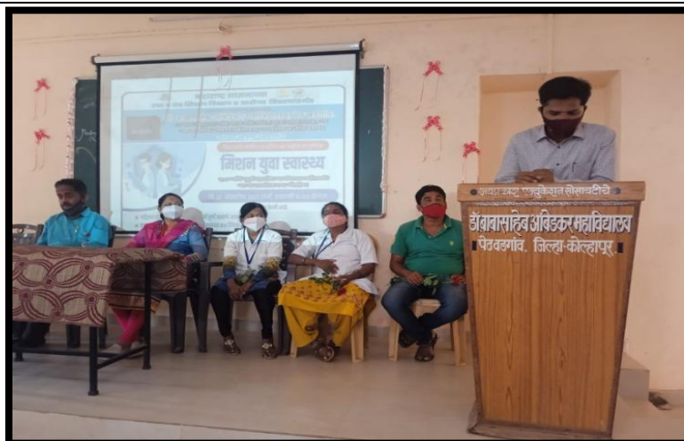
welcome the dignitaries present to the college