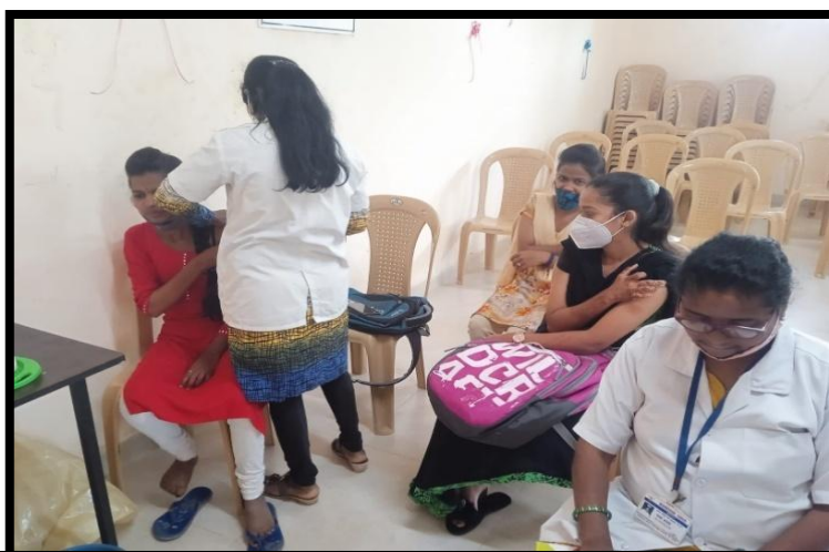
covid 19 Vaccination program in Campus.