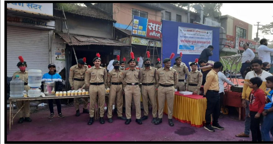
Speech about Environment Awareness Rally given by Chief officer of Municipal Council